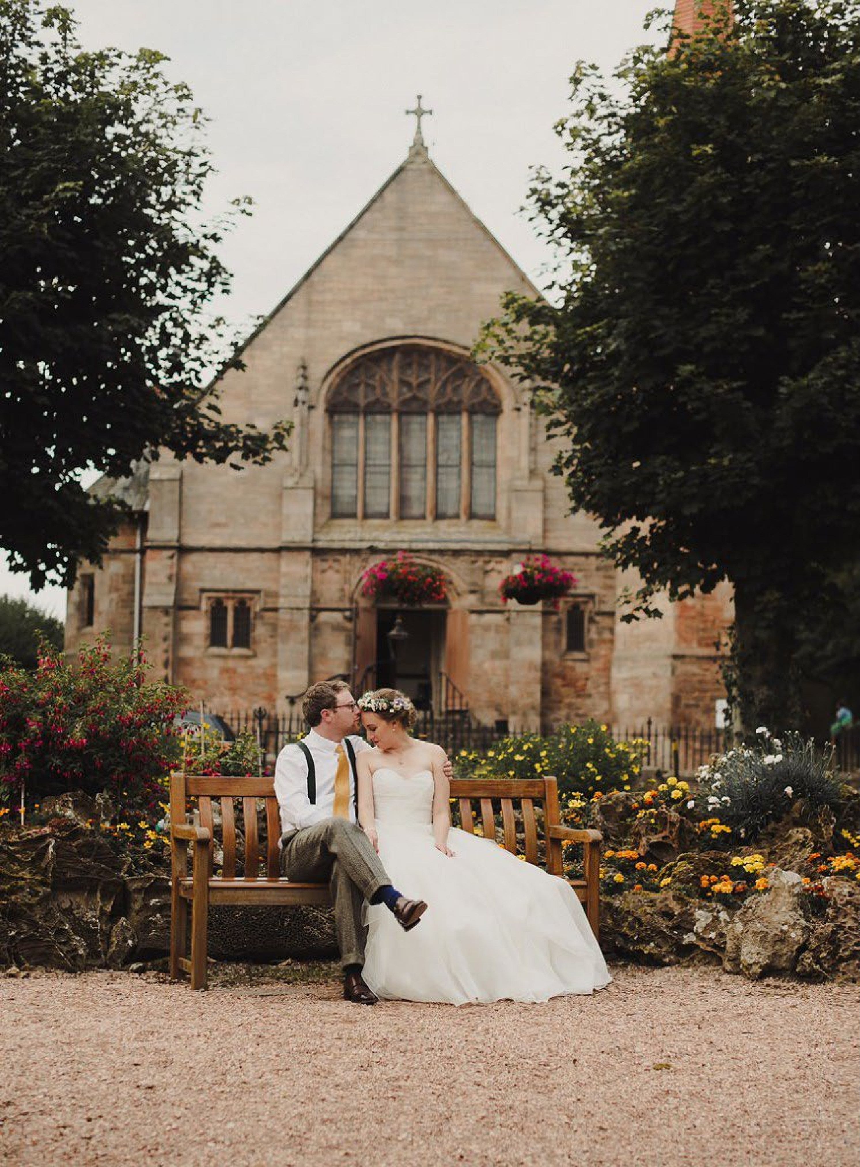
Victoria Gardens is opposite our hall and the perfect location for pictures.